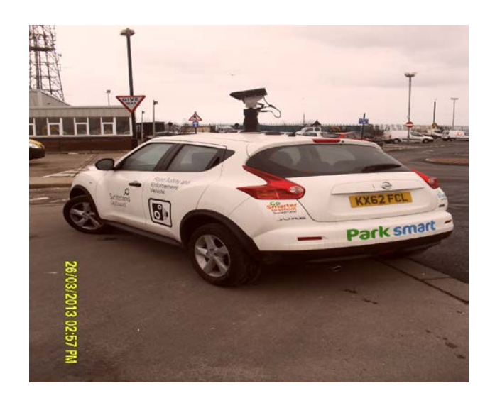
From the 1<sup>st</sup> April 2016 to 31<sup>st</sup> March 2017 the following income has been received from the 2073 Penalty Charge Notices issued by the Road Safety vehicle for the following contraventions: